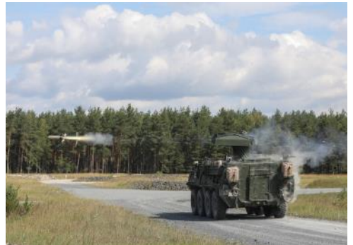
Soldiers launch a missile using a Stryker-mounted antitank weapon system during training at the Grafenwoehr Training Area in Germany, Aug. 14, 2019.