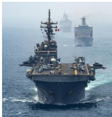
The USS Boxer, the USNS Tippecanoe and the USS John P. Murtha transit the Strait of Hormuz, Aug. 12, 2019.