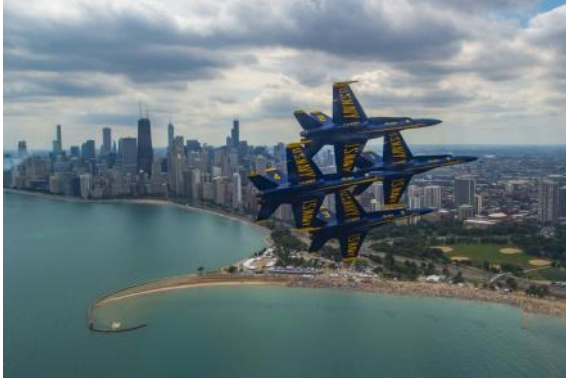
The Blue Angels, the Navy's flight demonstration squadron, perform during the 2019 Chicago Air and Water Show, Aug. 16, 2019.