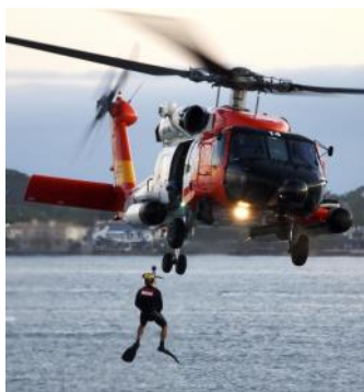
Coast Guard personnel conduct a search and rescue demonstration from an MH-60T Jayhawk helicopter in San Diego, Aug. 10, 2019.