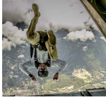
A service member jumps out of an MV-22B Osprey during parachute training at Marine Corps Training Area Bellows, Hawaii, Aug. 13, 2019.