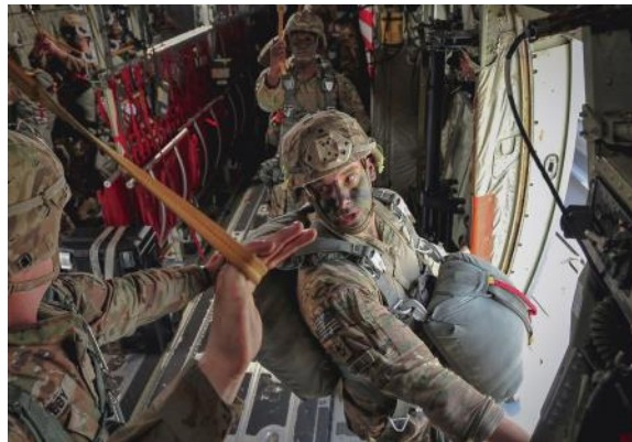
Army paratroopers take part in an airborne operation above the Frida Drop Zone in northeastern Italy, Aug. 8, 2019.