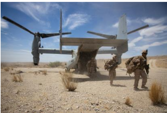
Marines exit an MV-22B Osprey during a training exercise at Marine Corps Air Ground Combat Center Twentynine Palms, Calif., Aug. 3, 2019.