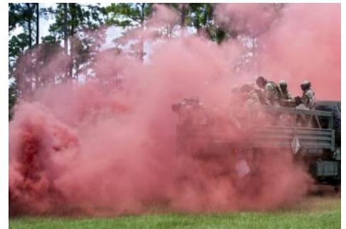
Airmen move through smoke during a tactical leaders course at Moody Air Force Base, Ga., Aug. 10, 2019.