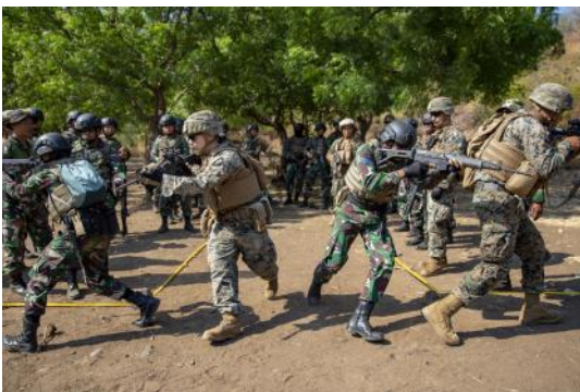
U.S. and Indonesian Marines train together during the Korps Marinir Platoon Exchange 2019 program in Surabaya, Indonesia, Aug. 9, 2019.