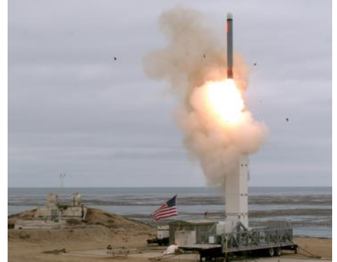
On Aug. 18, at 2:30 p.m. Pacific Daylight Time, the Defense Department conducted a flight test of a conventionally configured ground-launched cruise missile at San Nicolas Island, Calif. The test missile exited its ground mobile launcher and accurately impacted its target after more than 500 kilometers of flight..