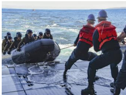
U.S. sailors pull a combat rubber raiding craft carrying Japanese soldiers aboard the USS Pearl Harbor in the Pacific Ocean, Feb. 6, 2020, during Iron Fist, an exercise designed to enhance U.S. and Japanese forces' ability to plan, communicate and conduct combined amphibious operations.