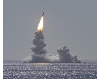
An unarmed Trident II missile launches from the submarine USS Maine off the coast of San Diego, Feb. 12, 2020. The successful launch demonstrated the readiness of the Navy's strategic weapon system.