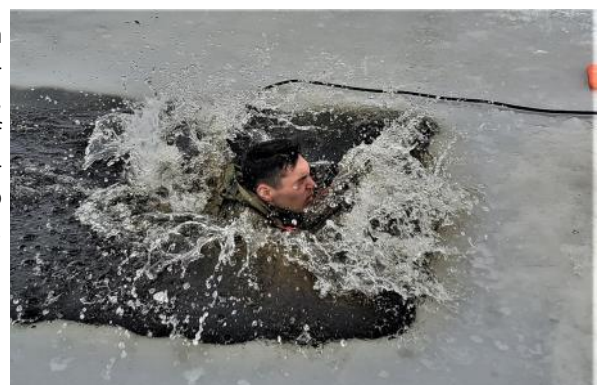
A student participates in a cold-water immersion training at Fort McCoy, Wis., Jan. 17, 2020, as a part of the Cold-Weather Operations Course. https://www.defense.gov/observe/photo-gallery/igphoto/2002244530