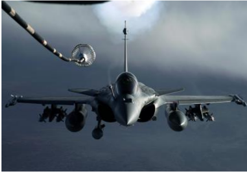
An Air Force KC-10 Extender conducts an aerial refueling with a French Dassault Rafale over Southwest Asia, Feb. 1, 2020.