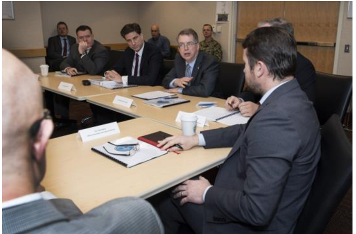
Deputy Defense Secretary David L. Norquist speaks about data analytics with industry experts at the Pentagon, Feb. 14, 2020. To his left is Defense Department Chief Information Officer Dana Deasy.

"This is an area where there's a great deal to be learned from industry," Norquist said. "We don't have to be ahead of industry. We just have to competently follow industry and take advantage of some of the things they've already done."