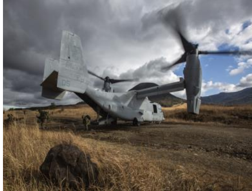
U.S. Marines and Japanese service members exit an MV-22B Osprey during vertical assault training at Camp Takayubaru in Kumamoto, Japan, Jan. 28, 2020, as part of Forest Light Western Army.