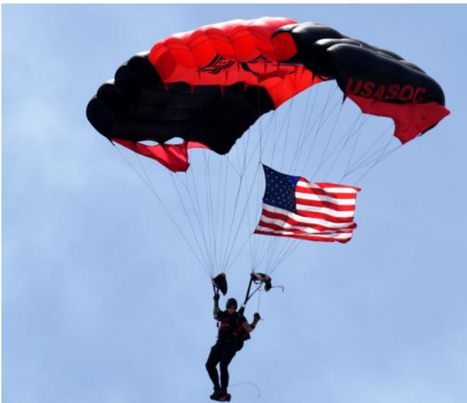
A soldier assigned to the Army Black Daggers Parachute Demonstration Team carries the U.S. flag during a performance at the Keesler and Biloxi Air and Space Show in Biloxi, Miss., May 5, 2019.

https://mail.google.com/mail/u/0/#inbox/FMfcgxwCgpZxmQgrpZFBMbLpSjvKBpTr