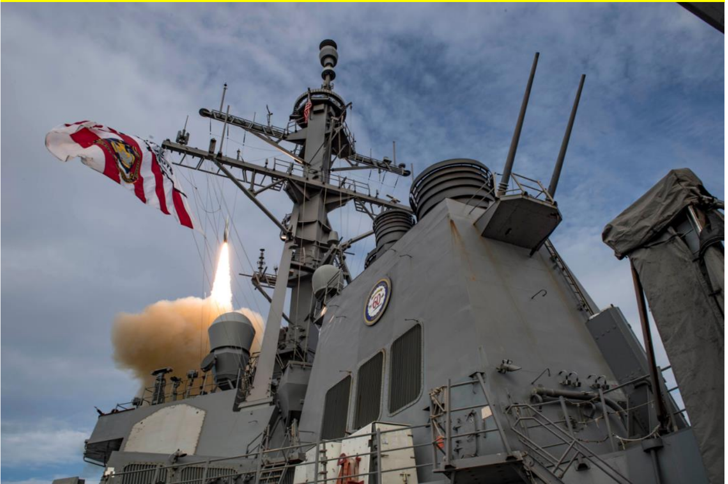
The USS Carney fires an SM-2 missile during a live-fire exercise as part of Formidable Shield 19 in the Atlantic Ocean, May 17, 2019. Formidable Shield is designed to improve allied interoperability using NATO command-and-control reporting structures.