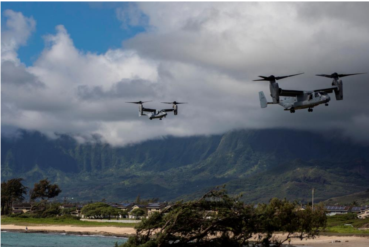
A pair of MV-22B Ospreys arrive at Marine Corps Base Hawaii, May 11, 2019.