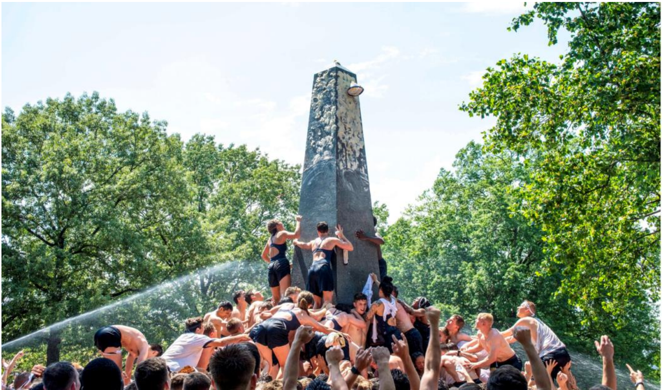
U.S. Naval Academy midshipmen scale the grease-covered Herndon Monument at the school in Annapolis, Md., May 20, 2019. In the annual rite of passage, first-year students form a human pyramid to replace an underclassman's "Dixie cup" hat at the top of the obelisk with an upperclassman's cover.