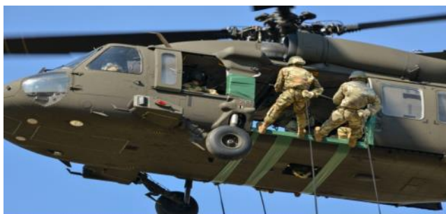
Soldiers conduct rappelling and ruck march during air assault course at the Grafenwoehr Training Area, Germany, Sept. 20-21, 2018.

https://mail.google.com/mail/u/0/#inbox/FMfcgxwCgpZxmQgZNBrdWBWqmNhjktC