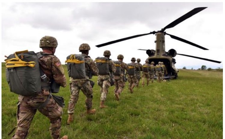
Army paratroopers enter a CH-47 Chinook helicopter during an airborne operation at the Juliet drop zone in Pordenone, Italy, May 9, 2019.

https://mail.google.com/mail/u/0/#inbox/FMfcgxwCgpZxmQgrpZFBMbLpSjvKBpTr