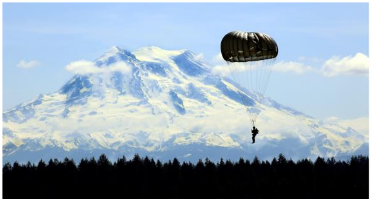
A soldier parachutes near Mount Rainier while preparing to land at Joint Base Lewis-McChord, Wash., May 5, 2019.