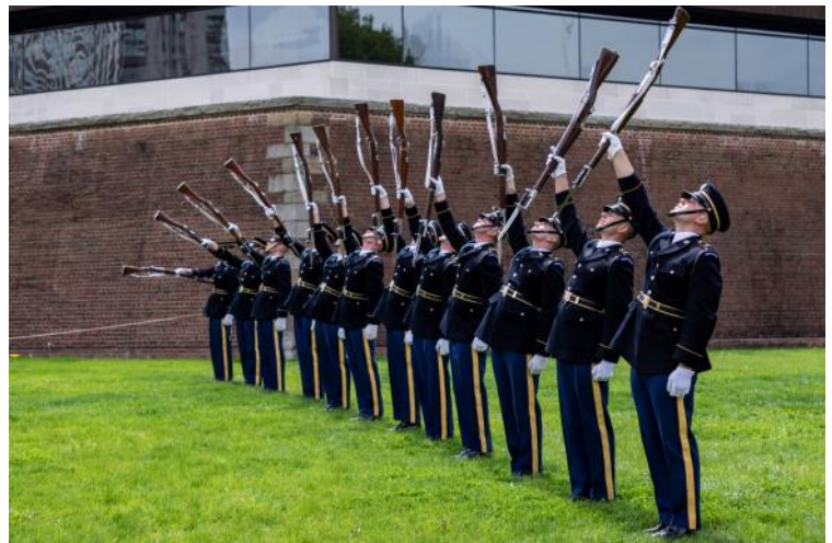
The U.S. Army Drill Team performs during a Meet Your Army event at Point State Park in Pittsburgh, May 4, 2019

https://dod.defense.gov/News/News-Releases/News-Release-View/Article/1857279/readout-of-acting-secretary-of-defense-patrick-shanahans-meeting-with-vietnam-d/source/GovDelivery/