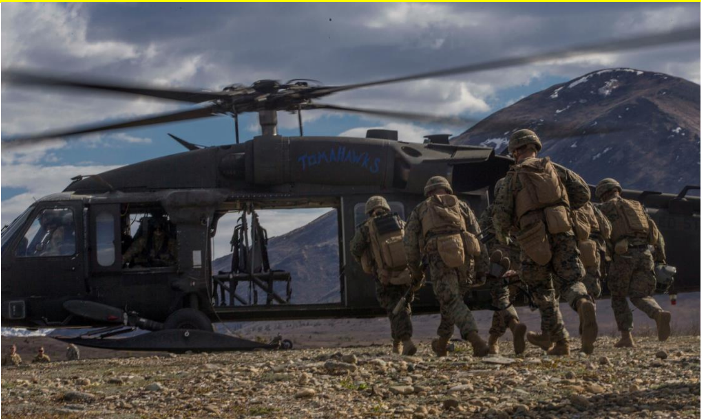
Marines run toward a helicopter during tactical recovery of aircraft and personnel training at Fort Greely, Alaska, May 15, 2019.