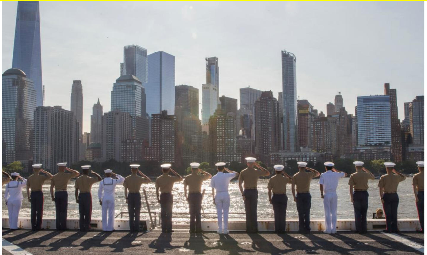
Sailors and Marines salute from the flight deck of the USS New York while transiting the Hudson River en route to a pier in Manhattan during Fleet Week New York, May 22, 2019.