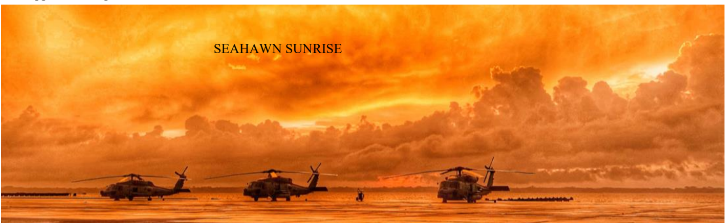
Three MH-60R Sea Hawk helicopters line the seawall as the sun rises over the St. Johns River at Naval Air Station Jacksonville, Fla., June 13, 2019.

Coast Guard officer cadets handle the lines aboard the Coast Guard cutter Eagle off the coast of The Hague, Netherlands, June 20, 2019. The Eagle, which is used as a training cutter for future officers of the Coast Guard, is taking part in a tall ships festival, which consists of sailing ships crewed by over a dozen countries.