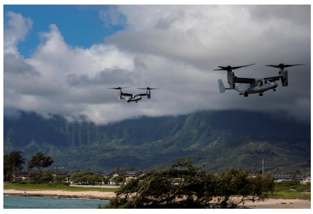
A pair of MV-22B Ospreys arrive at Marine Corps Base Hawaii, May 11, 2019.