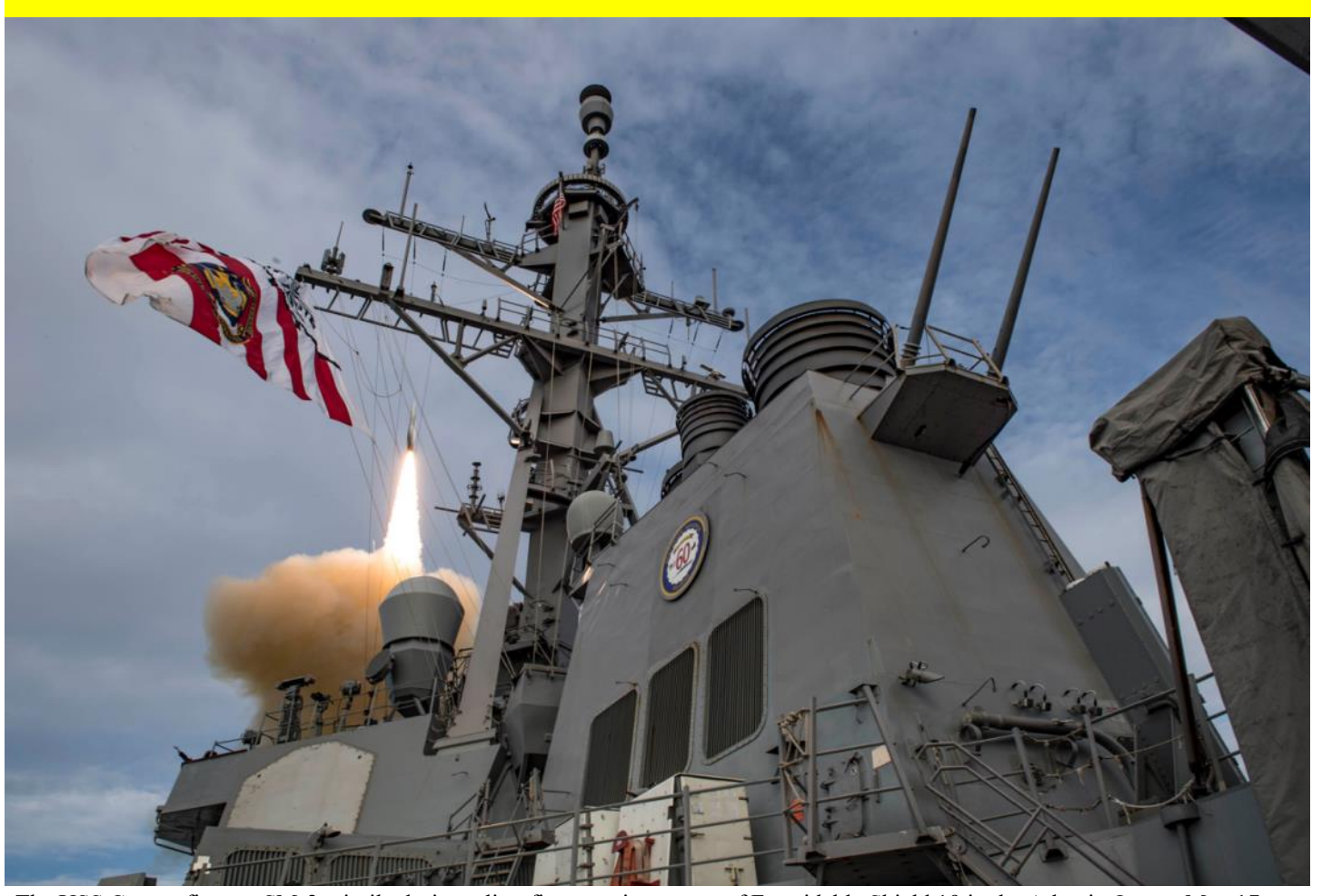
The USS Carney fires an SM-2 missile during a live-fire exercise as part of Formidable Shield 19 in the Atlantic Ocean, May 17, 2019. Formidable Shield is designed to improve allied interoperability using NATO command-and-control reporting structures.