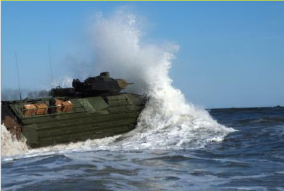
An amphibious assault vehicle with the 24th Marine Expeditionary Unit enters the water at Camp Lejeune, N.C., Oct. 3, 2018 to embark on USS New York in preparation for Exercise Trident Juncture 2018. Events during Trident Juncture will provide the unit opportunities to exercise expeditionary capabilities in unique environments.