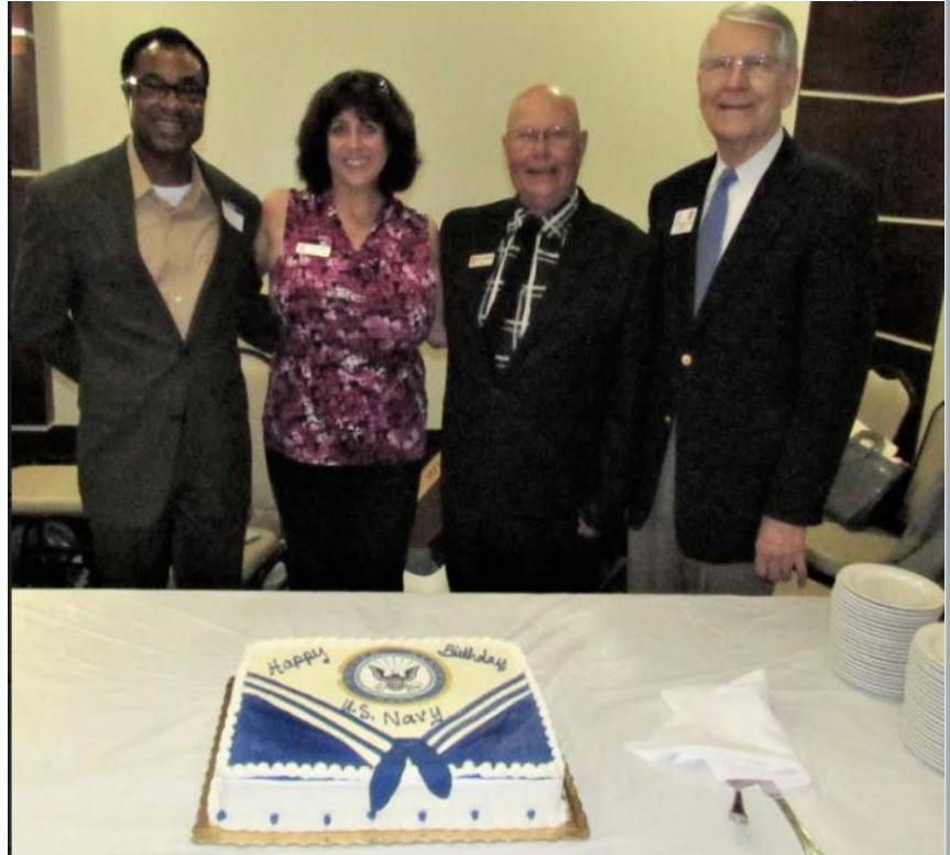
NAVY RETIREES CELEBRATING THE 273rd BIRTHDAY OF THE UNITED STATES NAVY