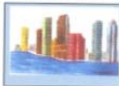
Painting by Jim Kalamoris

600 E. Klosterman Rd. Fine Arts Building FA132