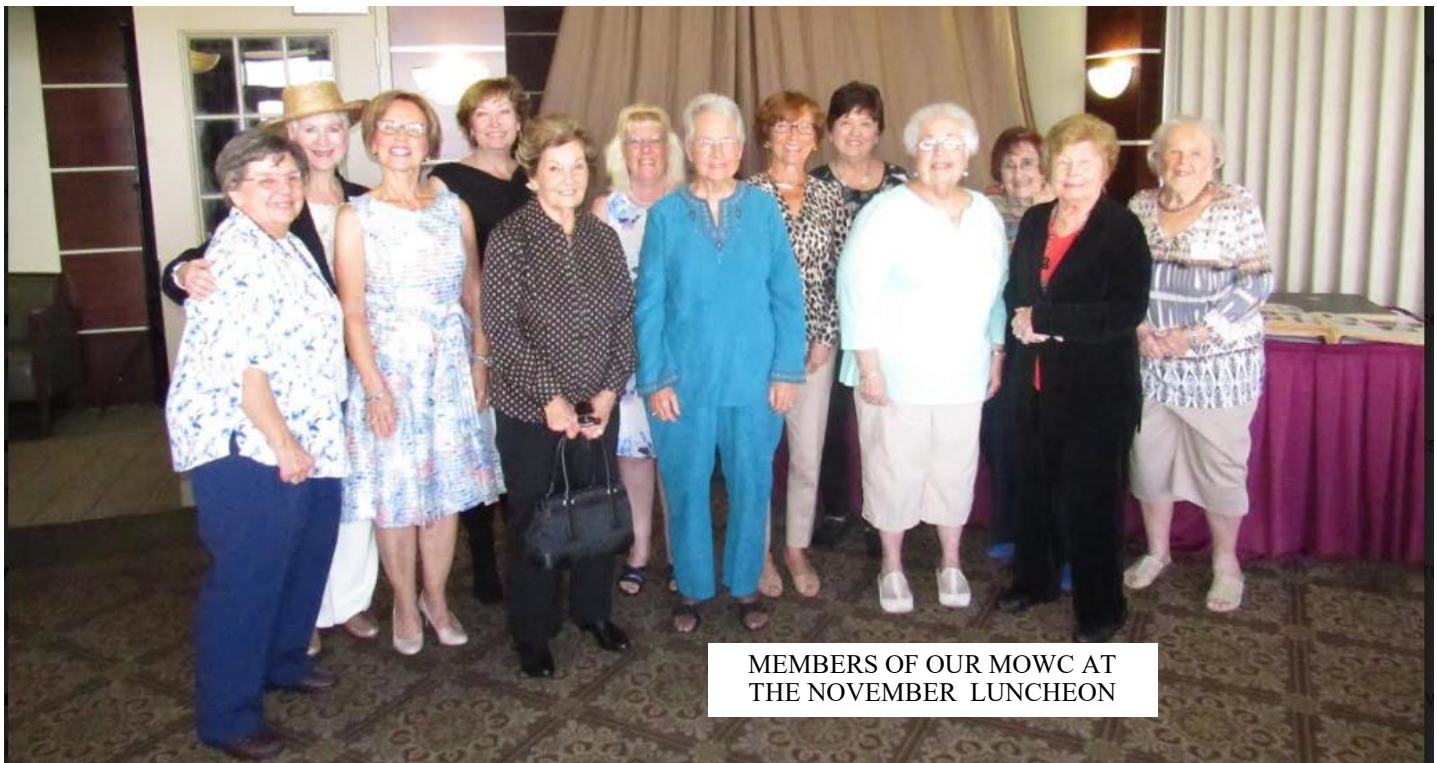
MEMBERS OF OUR MOWC AT THE NOVEMBER LUNCHEON

I hope this information provides insights that are helpful to you. Thanks so much for your membership and even more, your involvement with the Tampa Chapter's activities. The significance of your continued service is unmatched. Thank you for continuing to give back!