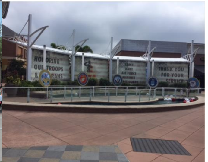
Honoring the military at Westfield Brandon Town Center.