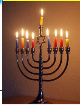
A hanukkiah, menorah with nine branches