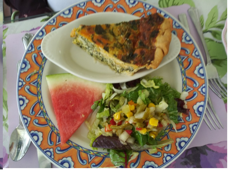
Shirley had Spinach, Mushroom, Cheese Quiche